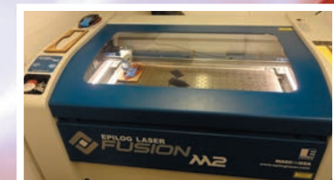
Epilog CO2 for lasering antler, glass, wood and plastic.